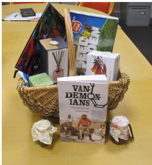
The fabulous hamper, to be won in the Society's raffle.

We have put together a large hamper of assorted goodies, books (including the winner of the 2022 Premier's Award for History), tea, a china cup, homemade jams, wine, etc., to be raffled. Tickets are $2 each or 3 for $5, and can be purchased on Tuesdays or at the Night Market (see above). Tickets can also be arranged if payment is made directly into our account at BSB 633000, Account 1531034, reference 'Raffle' and an email sent to that effect. The raffle will be drawn at the afternoon tea on 13 December.