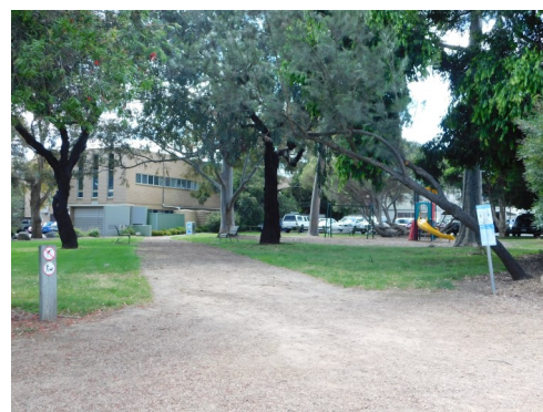
Linsley Park, at the corner of Bank and Linsley Streets; site of the Society's picnic in the park, 13 December.

It is planned to re-open the Heritage Centre on Tuesday, 17 January 2023.