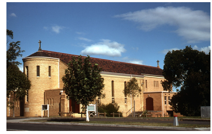
St Peter's Box Hill, pictured before the addition of an extension to the north, in the mid-2000s.

1920s. Soon after the December 1949 fire, in 1950, St Peter's Project Phoenix was commenced and a new, but incomplete church to Williams' design was dedicated in 1953. When the original brick St Peter's church was destroyed by fire in 1967 the insurance enabled the completion of the new church to Williams' design, including the chancel and sanctuary, but not the tower. A mosaic mural was installed on the sanctuary 'east' wall in 1978 and a well-appointed pipe organ replaced the Conn electronic in 1991. An extension of the church towards the street, to provide some office and small meeting space, was added in the mid-2000s and in 2007 the parish became host to a Sudanese congregation, with outreach including the Saturday morning school and the Dream Stitches sewing programme for migrant and refugee women. A Mandarin congregation relocated to St Peter's in 2014 and holds regular Sunday services.