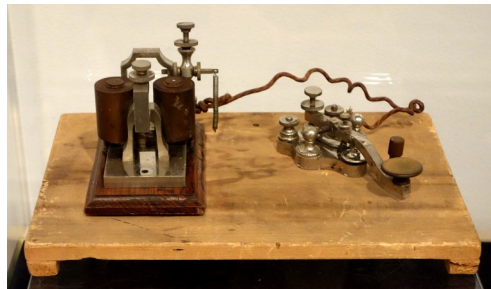
A morse code key—modern communication technology from a bygone era.