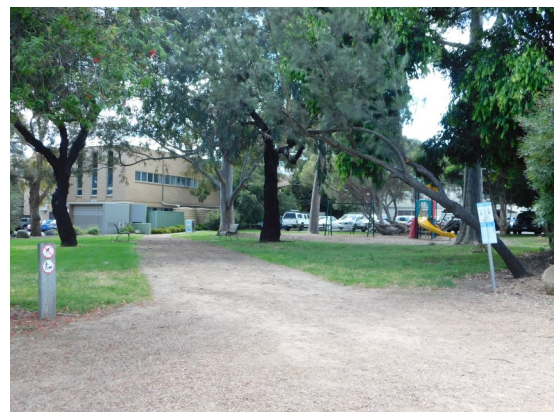
Linsley Park, at the corner of Bank and Linsley Streets; site of the Society's picnic in the park, 14 December 2021.