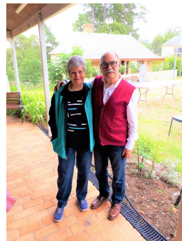
The President and Secretary in the garden at Schramm's Cottage. This venue holds a special significance for the couple, as they were married there in April 1994.

The next meeting of the Association is to be held on Saturday 17 April . It will be hosted by Mooroolbark History Group at Hookey Park Rotunda in Station Street, Mooroolbark.